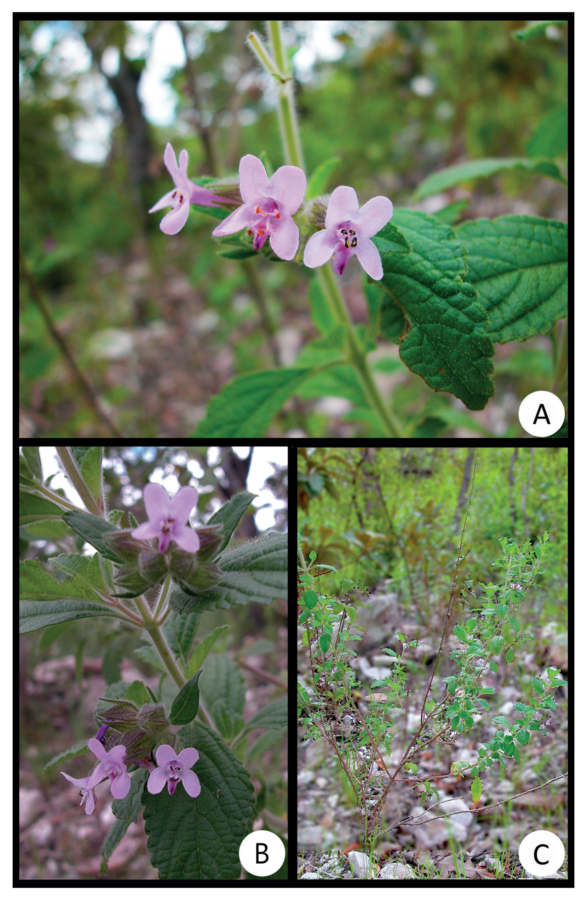
Figure 2. Marsypianthes tubulosa. A-B. Cyme detail. C. Habit. (Photos by Raymond Harley).