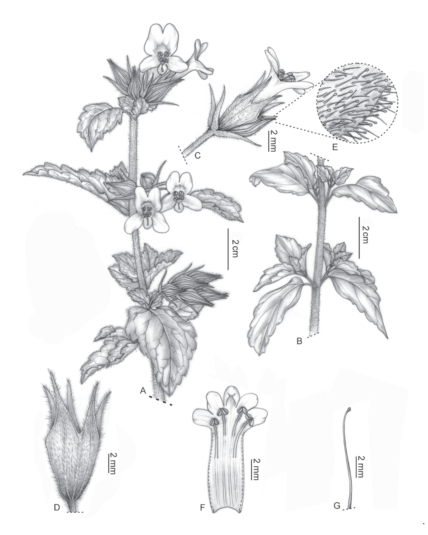
Figure 1. Marsypianthes tubulosa . A–B . Flowering branch. C . Cyme side view. D . Calyx at anthesis. E . Calyx indumentum detail. F . Dissected corolla. G . Style.