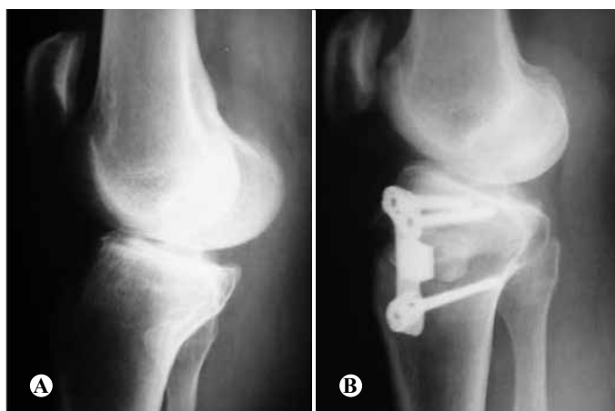
Figure 3 – (A) Preoperative radiograph; (B) Postoperative radiograph showing reduction of the patellar height in a patient who underwent osteotomy and fixation using a Puddu® plate.

The mean postoperative tibiofemoral angle in this group was 7.0° of valgus.