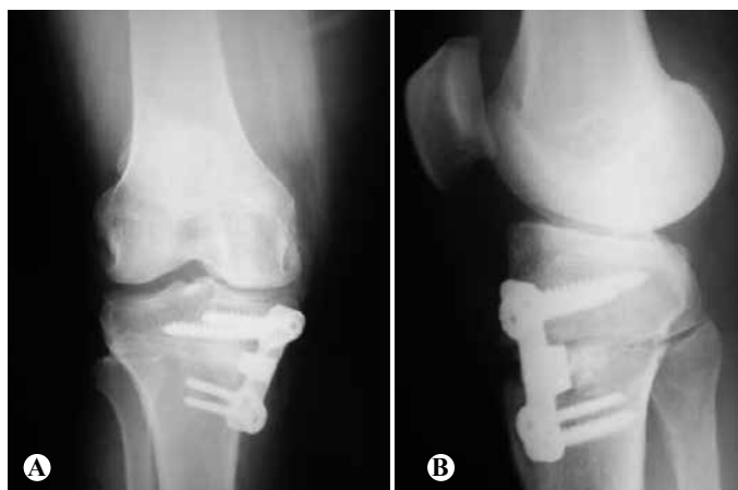
Figure 2 – (A) AP radiograph; (B) Lateral view of a patient in group I who underwent osteotomy and fixation using a locked plate with tab (Puddu® plate).

The mean preoperative angular deviation was 5.9 degrees of varus (ranging from 2 to 12°). The mean correction obtained in this group was 12.9 degrees.