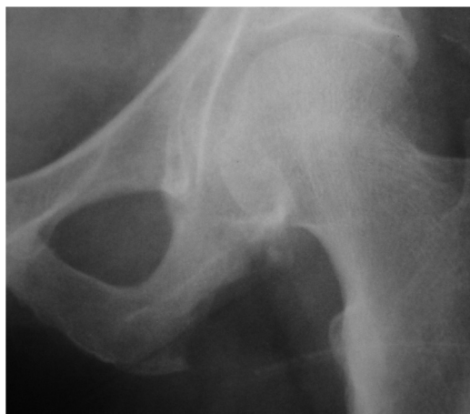
Fig. 3 – After the operation, with en-bloc resection of the tumor development.

Osteochondromas are bone exostoses formed by cortical and medullary bone that is continuous with the originating bone and is covered with a coating of hyaline cartilage. Osteochondromas have their own growth plate, which produces bone that forms the exostosis. It is believed that osteochondromas arise from a change in growth direction of the epiphyseal disc, which grows persistently and later on undergoes endochondral calcification. The lesion continues to grow from the cartilaginous coating, just like a normal epiphyseal disc, and therefore growth after skeletal maturity is reached during puberty is not expected. This explains why the peak incidence of osteochondromas is in the second decade of life. 4 The patient reported here was in her fifth decade of life (42 years of age), an age group in which only 5% of the diagnoses are made. 5