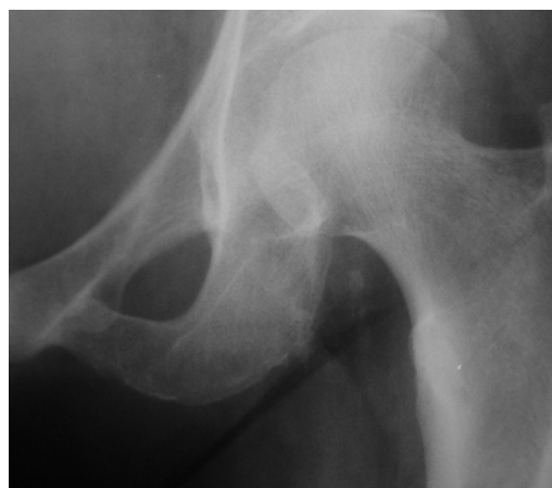
Fig. 1 – Preoperative radiograph on the left hip, in AP view, showing slight bone alteration in the ischium.

En-bloc resection surgery was performed on the tumor development in the left ischium, by means of the posterior