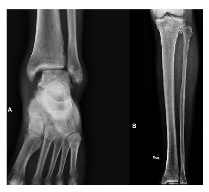
Fig. 1 Anteroposterior radiographs of the ankle (A) and the leg (B) showing ankle syndesmosis disjunction and proximal tibiofibular subluxation, respectively.

Active and passive knee and ankle mobilization started immediately after surgery. In addition, loading was immediately allowed with the use of an axillary crutch for partial