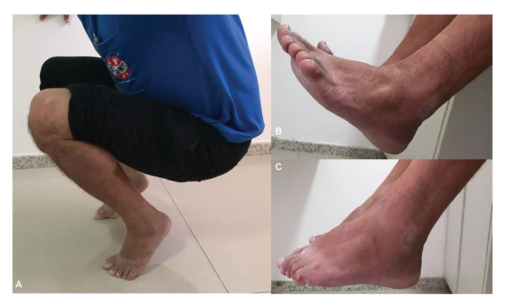
Fig. 4 Knee and ankle total arcs of motion (A); Total dorsiflexion (B); Total plantar flexion (C).

The distal tibiofibular syndesmosis is an injury frequently seen in the emergency room due to ankle torsional trauma. However, the isolated lesion of the ligament complex without fibular fracture is rare.<sup>3</sup>