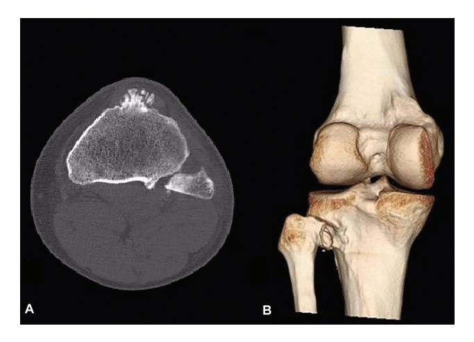
Fig. 2 Axial computed tomography scan of the proximal tibiofibular joint (A) showing an anterolateral proximal tibiofibular subluxation. Posterior view of computed tomography scan with 3D reconstruction of knee (B) showing the proximal tibiofibular anterolateral subluxation.

support. Isometric thigh and leg strengthening exercises were started at the same time. Total load was allowed within a month. The patient returned to work in two months and resumed sports activities in 3 months. After 6 months of follow-up, he had total knee flexion, dorsiflexion and plantar flexion, with no limitations ( Fig. 4 ).