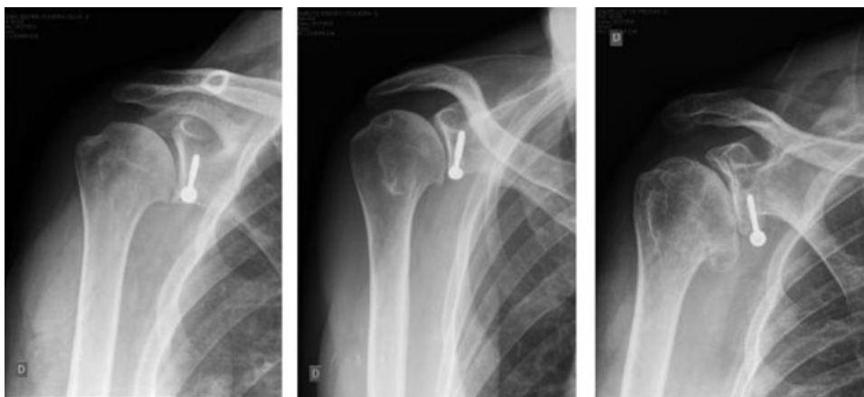
Fig. 2 Degree of shoulder arthropathy.