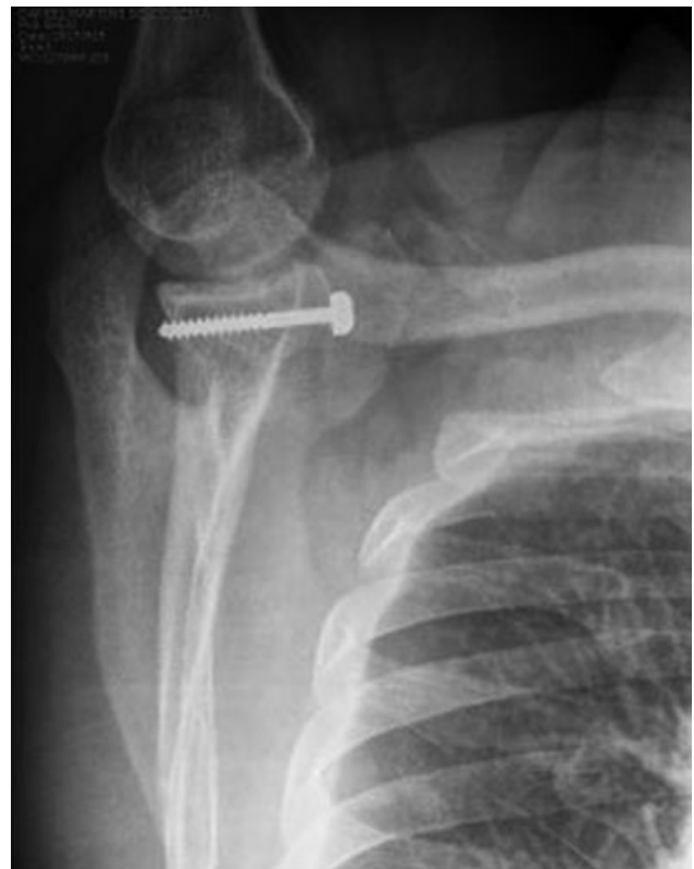
Fig. 5 Shoulder Xr in the Bernageau and Patte 24 incidence. The length of the screw, the position parallel to the glenoid, and the consolidated graft are observed.

Gordins et al. 22 reported that their arthropathy numbers in anterior shoulder dislocation are possibly inferior to those that could be expected, and they emphasized that arthropathy seen through the AP and axial incidences related to