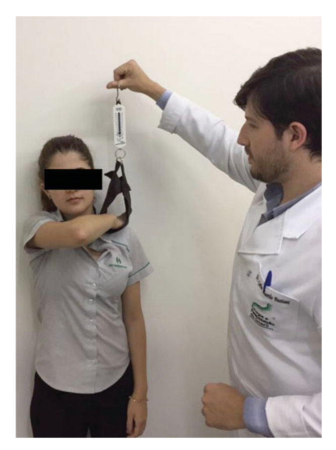
Fig. 2 Strength measurement at the bear hug test.