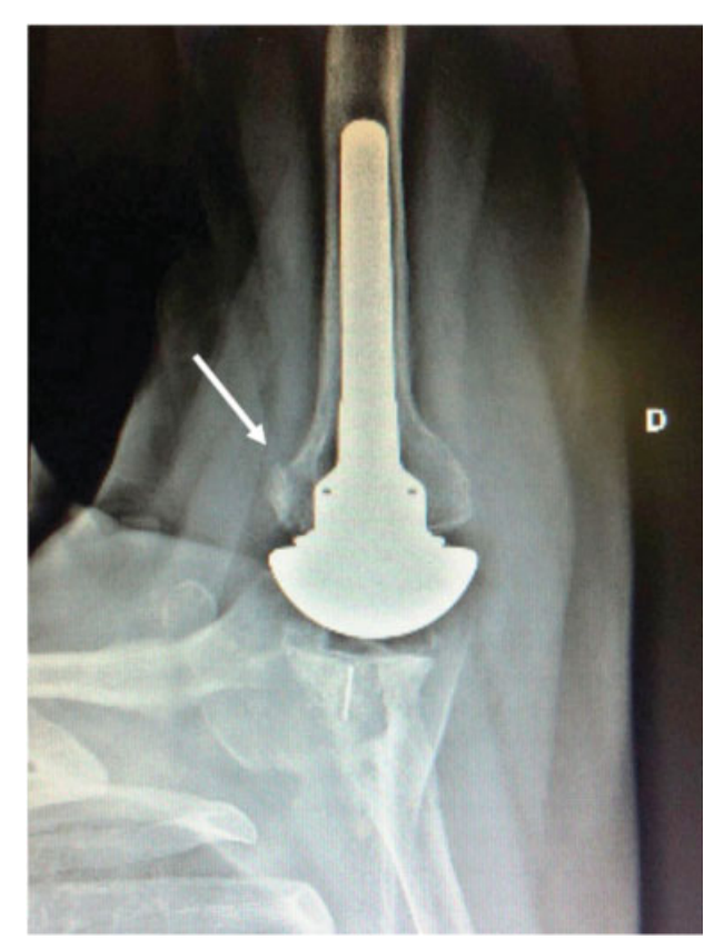
Fig. 3 Axillary lateral radiography showing lesser tuberosity healing after total shoulder arthroplasty.