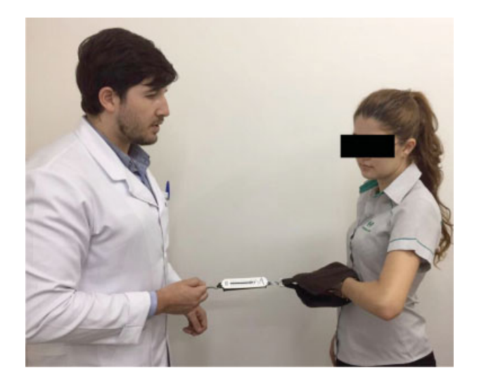
Fig. 1 Strength measurement at the belly press test.

Group A patients were submitted to an ultrasound examination to assess the integrity of the subscapularis muscle tendon, which was defined as normal tendon ( ~Figure 4A ), tendon with full thickness rupture not affecting the whole craniocaudal extension, or tendon with full extension rupture