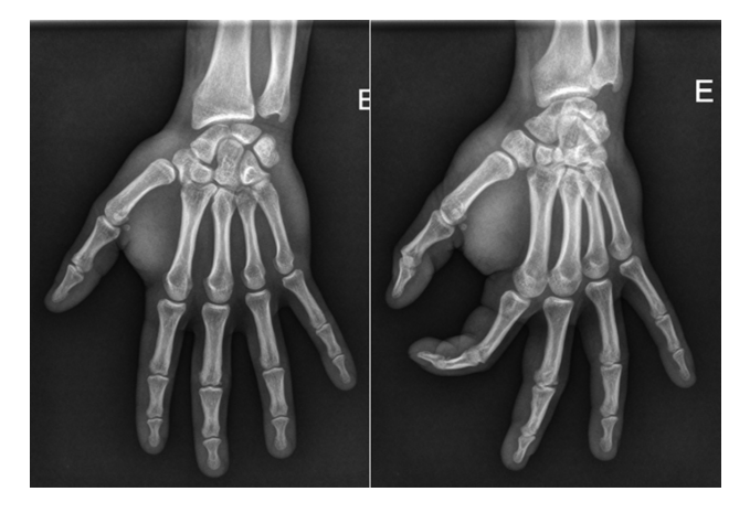
Fig. 2 Six-month follow-up.