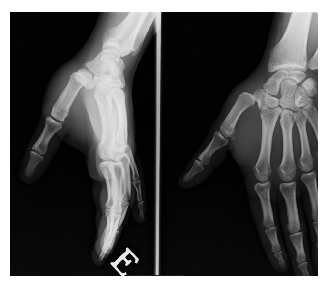
Fig. 1 Isolated carpometacarpal dislocation of the thumb.

The 6-months follow-up X-ray showed no signs of subluxation or articular degenerative changes (Fig. 2).