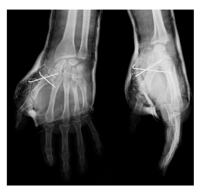
Fig. 4 Postoperative X-ray.