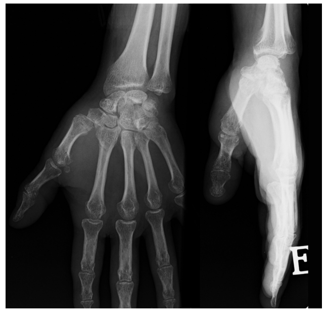
Fig. 5 Trapeziometacarpal subluxation at the 1- year follow-up.

Patel<sup>14</sup> said in 1983. Both patients discussed presented dorsal dislocation, but the authors could not specify which ligament was ruptured because they used closed treatment techniques.