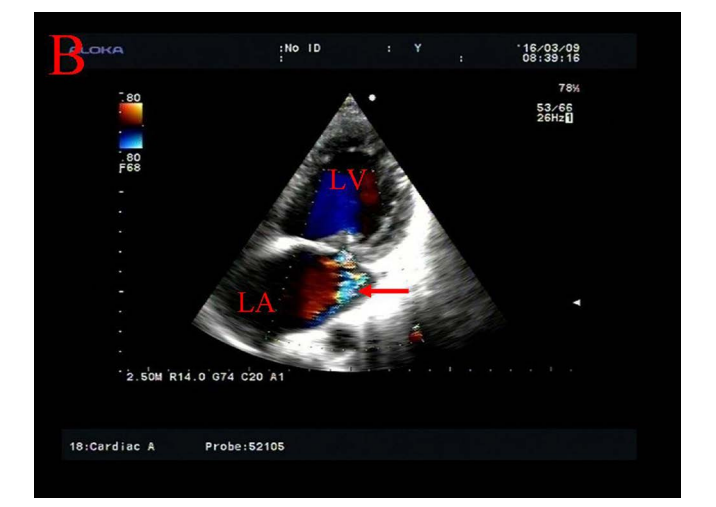
Fig. 1 - Transthoracic echocardiography of mitral valve prolapse. (A) Prolapse of the anterior mitral leaflet with movement of the coaptation behind the annular plane (arrow); (B) Mitral insufficiency with a regurgitant flow along the posterior wall of the left atrium (arrow).