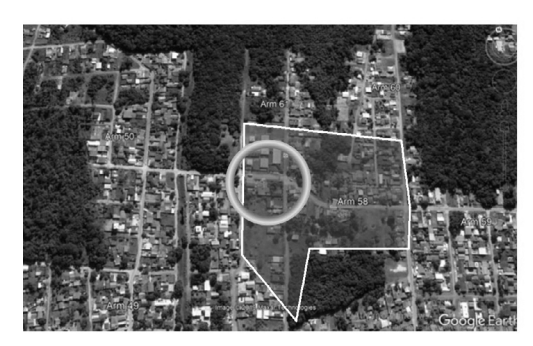
Figure 2: Monitoring of trap No. 58, before and after the intervention. Indicator of Aedes aegypti mosquito infestation. Circle demonstrates the school location in the territory.

the territory by the indicators of ovitrap monitoring, which exposed, in July 2019, the trap number 58, referring to the school, without any infested egg of the Aedes aegypti mosquito ( figure 2 ).