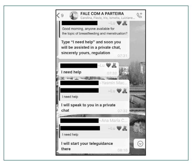
Figure 2. Teleguidance with a moderation team and midwife approach