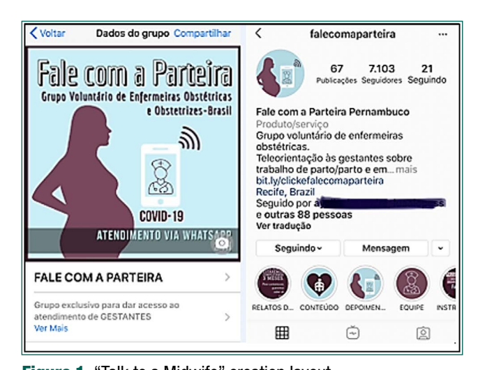
Figure 1. "Talk to a Midwife" creation layout

Figure 1 shows the layout for creating the group name. To the left there is the illustration of a WhatsApp* group profile and to the right, the Instagram* social network.