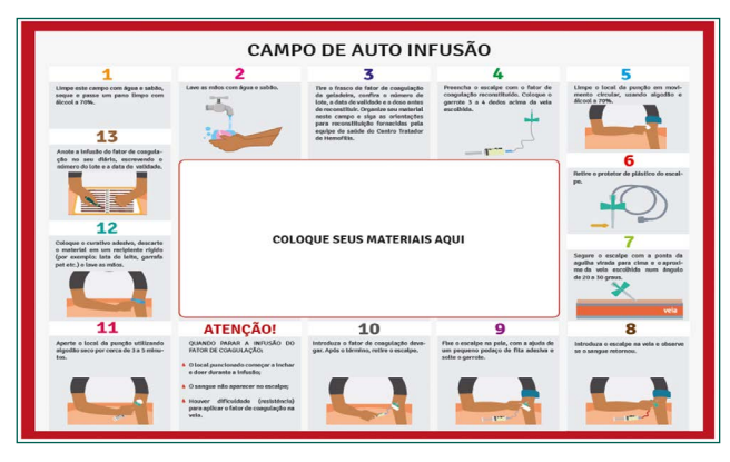
Figure 2. Final validated version of infographic "Campo de autoinfusão"

Infographic " Campo de autoinfusão " consists of coated printed material Polyvinyl Chloride (PVC), allowing it to be cleaned with disinfectants without damaging the images and texts. It presents the orientations arranged close to the edges of the material, in a numbered sequence, having the same initial measurements. Figure 2 represents the final version after assessment.