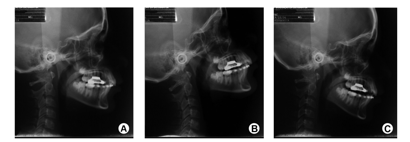
Figure 2. Lateral cephalograms taken in: A) NHP; B) NHP-Up; and C) NHP-Down.

Figure 1. Patient positioning for acquisition of lateral cephalograms in: A) NHP; B) NHP-Up; and C) NHP-Down.