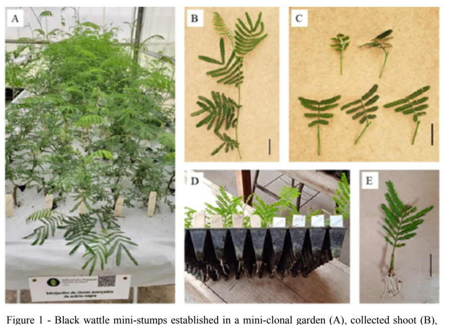
Figure 1 - Black wattle mini-stumps established in a mini-clonal garden (A), collected shoot (B), single-bud mini-cuttings (C), mini-cutting cultivated in 100-well polyethylene trays (D), and rooted mini-cutting (E). Bar = 3cm.

The variance components were estimated by the restricted maximum likelihood method (REML) and the prediction of phenotypic and genotypic values by the best linear unbiased prediction (BLUP) (RESENDE, 2002). Statistical model 82 was used, which corresponds to the model for evaluating individuals in half-sib progenies in one place, one plant per plot, in a completely randomized design, with the aid of the Selegen REML/BLUP software (RESENDE, 2016). The statistical model is expressed by: y = Xu +Za + e, where: y is the data vector; u is the vector of the effects of measurement-repetition combinations (assumed to be fixed) added to the overall mean, a is the vector of individual additive genetic effects (assumed to be random), and e is the vector of errors or residuals (random). Capital letters represent incidence matrices for these purposes.