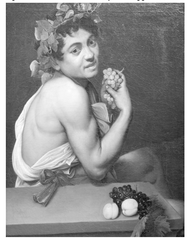
Figure 2 - "Bacchino Malato" by Caravaggio (1593)

to the denial of life, it is necessary to find ways to celebrate it as it is ( amor fati ), so that the will-to-live must be permanently invented in daily living to deal with the sadness experienced in everyday life (Maffesoli, 2003, p. 9).