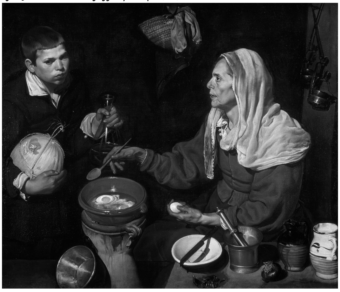
Figure 3 - "Old woman cooking eggs" by Velázquez (1618)