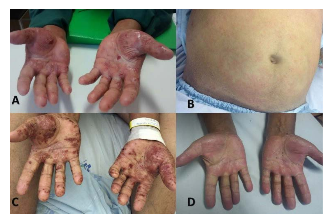
FIGURE 1. A) Erythematous, pruritic, scaly and flaky lesions on hands and B) abdomen (at tenth week of HCV treatment). C) Peeling areas, break blisters, skin fissures with bleeding and signs of secondary infection on hands (one week after the end of HCV treatment). D) Improvement of skin lesions after one week of a higher dose of prednisone and intravenous antibiotic.

A 49 year-old man with HCV related liver cirrhosis, genotype 1 and alcohol abuse was referred to our outpatient clinic for HCV therapy assessment. He was HCV treatment naïve, with arterial hypertension, diabetes, anxiety disorder and a tobacco user. He denied previous gastrointestinal bleeding, ascites or hepatic encephalopathy. He had a compensated liver function (Child-Pugh A, MELD 6), with a liver stiffness by Fibroscan® of 47.2 kPascal, compatible with Metavir F4 (cirrhosis). The upper digestive endoscopy revealed portal hypertension with esophageal varices. Baseline exams were as follows: hemoglobin: 15 mg/dL, leukocytes: 8,710/mm³, platelet count: 193,000/ mm³, total bilirubin: 0.99 mg/dL [reference value (RV) < 1.2], urea: 41 mg/dL (RV < 43), creatinine: 0.9 mg/dL (RV < 1,2), alanine aminotransferase: 82 IU/L (RV < 50), aspartate aminotransferase: 48 IU/L (RV < 50), alkaline phosphatase: 117 IU/L (RV < 120), gamma glutamyl transferase: 300 IU/L (RV < 38), albumin: 4.0 g/dL (RV 3.5-5.2), INR: 0.9 (RV