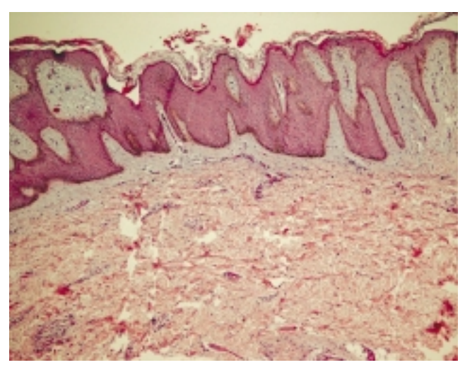
FIGURE 2: Hyperplasia of the epidermis, hyperpigmentation of the basal layer and diffuse deposition of homogeneous material on the papillary and upper dermis (HE, 20x)