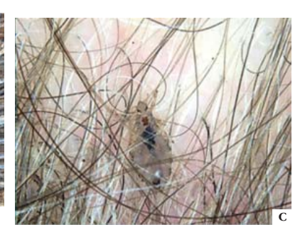
FIGURE 2: (A) Hyperchromic lesions on the lower limbs; (B) Scalp: presence of several nits (yellow arrows) and one louse (red arrow); (C) Dermoscopy of one Pediculus humanus corporis louse living in the occipital region of patient's scalp