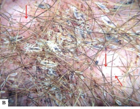
FIGURE 3: (A) Dermoscopy of patient's beard showing the presence of countless nits, nymphs and lice; (B) Dermoscopy showing several lice, nits and stinging spots (red arrows)

Pediculosis is a condition that has been affecting humanity over the entire history.¹ Pediculosis corporis manifests as urticarial papular and hemorrhagic lesions, mainly on the trunk, abdomen and buttocks, as well as excoriations, lichenification, and hyperchromia, characterizing the so-called "vagabond's dis-