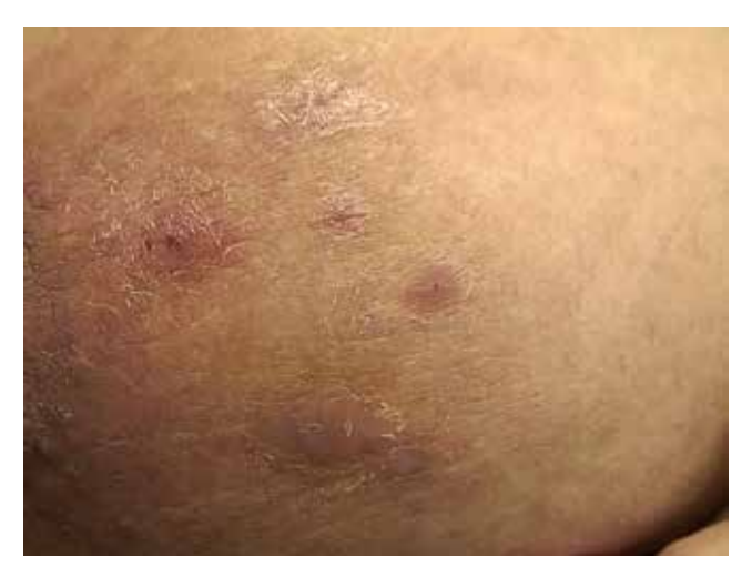
FIGURE 2: Erythematous scaly papules on the anterior trunk