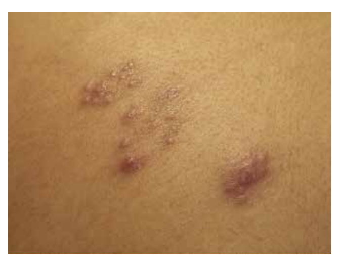
FIGURE 1: Multiple erythematous papules, isolated or in plaques, on the back

A 14-year-old girl, with weight and height appropriate for her age, presented with pruritic, erythematous papules and plaques on the anterior and posterior trunk that had been present for two months (Figures 1 and 2). At 11 years of age, the patient was diagnosed with severe Crohn's disease (CD), refractory to multiples treatments. At the time of her first appointment in our clinic, she was using infliximab, 10 mg/kg, with a persistent perianal ulcer and chronic diarrhea, and levothyroxine for controlled hypothyroidism. The patient denied contact with contaminated water or ponds. A skin biopsy from her back showed superficial and deep perivascular lymphohistiocytic inflammatory infiltrate, associated with perifolliculitis and formation of poorly defined granulomas (Figure 3). Culture and special stains for bacteria, fungi, and parasites were negative. As diarrhea worsened, a course of 60 mg/day of prednisone was prescribed, resulting in a significant improvement of the intestinal condition and total resolution of skin lesions (Figure 4).