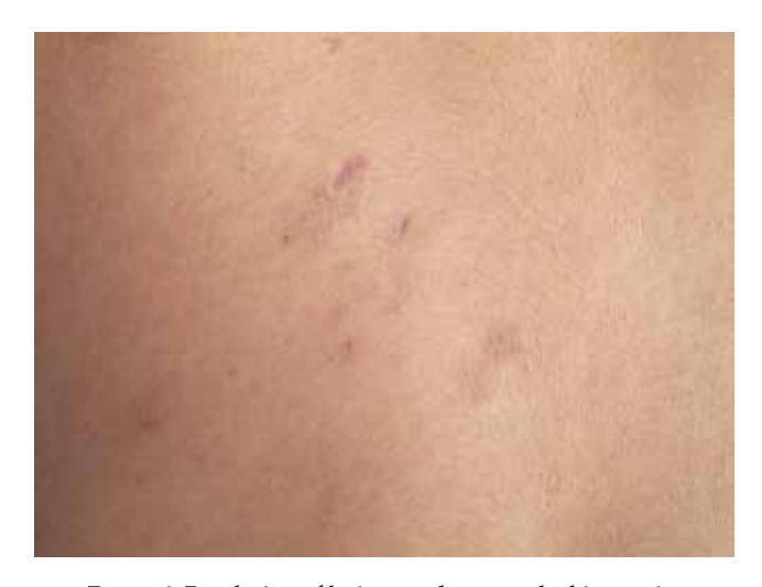
\textbf{Figure 4:} \ Resolution \ of \ lesions \ and \ scar \ on \ the \ biopsy \ site