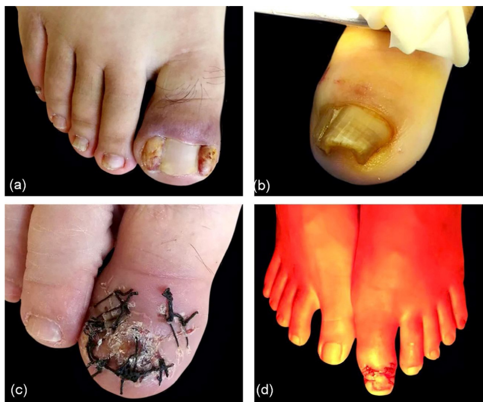
Figure 4 Key points. (A), Large masses in triangular regions. (B), Thick nail plate. (C), Remove the entire nail plate before the operation. (D), Management with water-filtered infrared-A (wIRA).

the present technique was used to treat 67 patients, and had no recurrence observed after six months to one year of follow-up.