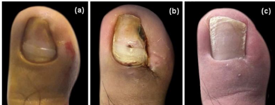
Figure 3 Cosmetic result. (A), Preoperative image. (B), After stitch removal on the 14 th day. (C), Follow-up after one year.