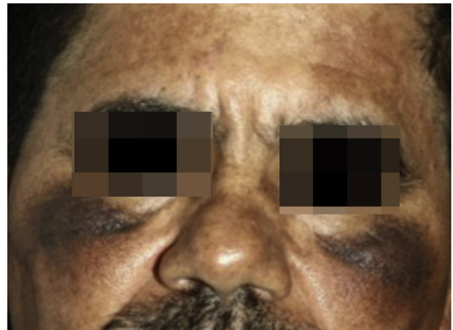
Figure 1 Patient showing grayish maculae on the malar prominences and brownish maculae on the frontal, malar and nasal regions.

The patient was instructed to discontinue the use of hydroquinone and to use sunscreen. As therapy, the 1064 nm QS Nd:YAG laser (Etherea, Vydence Medical) was used, first during eight sessions per month (toning mode, fluence between 1.0–1.3 J/cm 2 , spot size of 8 mm, frequency of 10 Hz), followed by four sessions a month with fluence between 4–5 J and spot size of 5 mm, with slight improvement (Fig. 3). Subsequently, he underwent seven sessions, one per month, of intense pulsed light (IPL; Etherea, Vydence Medical; 580 nm filter, 15 J/cm 2 fluence, 15 ms pulse), with partial response (Fig. 4). Finally, fractional 10,600 nm CO 2 laser (Sculptor, Vydence Medical) was used with a 120 nm tip, energy between 80–100 mJ and density of 50 MTZ/cm 2 (total of five bimonthly sessions), with sig-