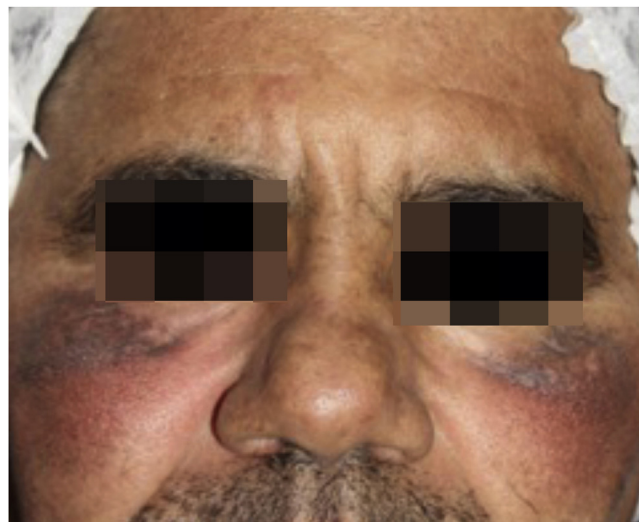
Figure 4 Partial response after seven sessions of Intense Pulsed Light (IPL; Etherea, Vydence Medical) using a 580 nm filter, with a fluence of 15 J/cm 2 and a single pulse of 15 ms.

Clinically, EO presents as blue-gray macules or papules on photoexposed areas (mainly over bony prominences) of the face and cervical region. 2 Histopathologically, short,