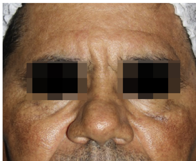
Figure 5 Significant lesion improvement after five sessions of fractional 10,600 nm CO 2 laser (Sculptor, Vydence Medical) with 120 nm tip, energy between 80–100 mJ and density of 50 MTZ/cm 2 .

curved, ocher-colored fibers (described as “banana bodies”) are identified in the papillary and superficial reticular dermis. In more advanced cases, due to the degeneration of the ochronotic fibers, the deposits appear amorphous and eosinophilic. 2,3,5