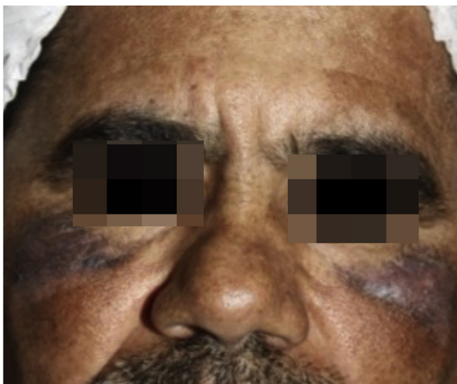
Figure 3 Slight improvement of lesions after the use of QS Nd:YAG 1064 nm laser (Etherea; Vydence Medical) for eight sessions in toning mode (fluence between 1.0–1.3 J/cm 2 , 8-mm spot size and frequency of 10 Hz), followed by four sessions with a fluence of 4–5 J and a spot size of 5 mm.

ity, with subsequent accumulation of HG, which polymerizes to form the ochronotic pigment. 2,5