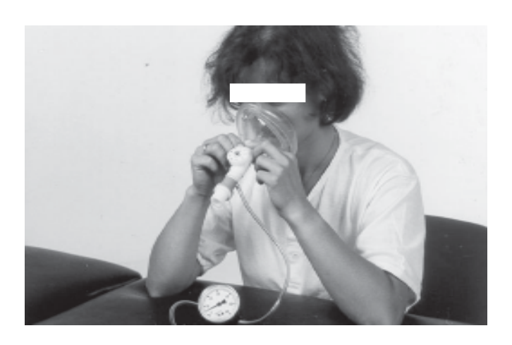
Figure 7. Breathing exercises using positive expiratory pressure (PEP) mask on a patient with cystic fibrosis.