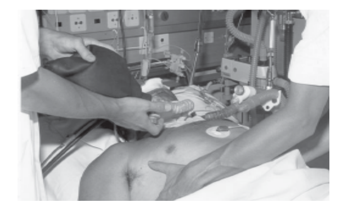
Figure 8. Manual hyperinflation and chest wall compression in a ventilated patient.

Mechanically ventilated patients are often unable to perform forced expiratory maneuvers effectively, due to unconsciousness. Manual hyperinflation combined with chest wall compression during expiration ("bag squeezing", Figure 8) is frequently applied in clinical practice, and this improves oxygenation and lung compliance, and facilitates secretion removal<sup>89-91</sup>. Potential detrimental cardiovascular effects must be taken in consideration when applying manual hyperinflation<sup>92</sup>. Its effectiveness in preventing pulmonary complications and pneumonia has been questioned, but recent data provide some evidence that physical therapy may indeed add to the prevention of ventilator-associated pneumonia<sup>93</sup>.