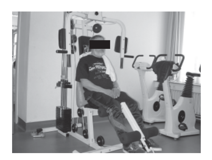
Figure 1. Resistance muscle training for lower limbs in a patient with COPD.

Clinical conditions associated with severe deconditioning, such as critical illness and burn injuries need input from physiotherapists, to maintain or restore the patient's ability to be "upright and moving" and thus shorten bed rest<sup>10</sup>. Mobilization enhances oxygen transport, muscle function, joint mobility and coordination of movement. Prevention of muscle atrophy is best achieved with active muscle contractions, but critically ill patients are often unable to perform voluntary contractions. Under these conditions, active or passive cycling (Figure 2) or passive muscle stretching has been shown to prevent muscle fiber atrophy and protein loss, in comparison with twice-a-day passive stretching of less than 5 minutes per session<sup>11</sup>. Moreover, electrical stimulation of the quadriceps (Figure 3) not only gives rise to active limb mobilization but also enhances muscle strength and decreases the number of days needed to transfer from