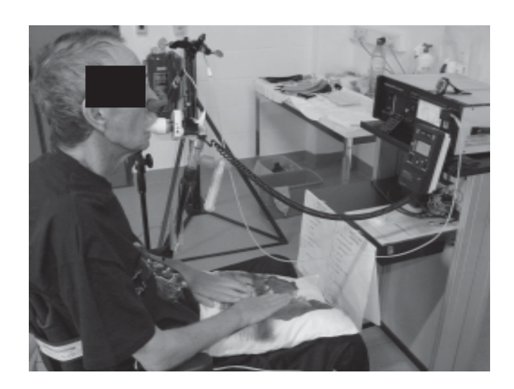
Figure 5. Normocapnic hyperpnea training in a patient with spinal cord injury.

Three types of training are practiced at the present time: inspiratory resistive training (IRT), threshold loading (ITL) and normocapnic hyperpnea (NCH). During NCH the patient is asked to ventilate maximally for 15-20 minutes (Figure 5).