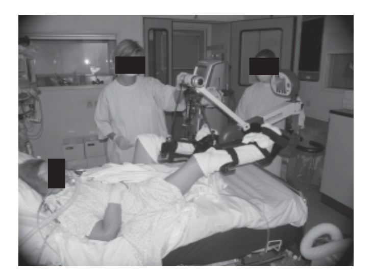
Figure 2. Device for active and passive cycling in a bedridden patient in intensive care (Motomed Letto, RECK Germany).

bed to chair<sup>12</sup>. Recent studies have underpinned the need for exercise training after a period of critical illness, to enhance functional capacity<sup>13</sup>.