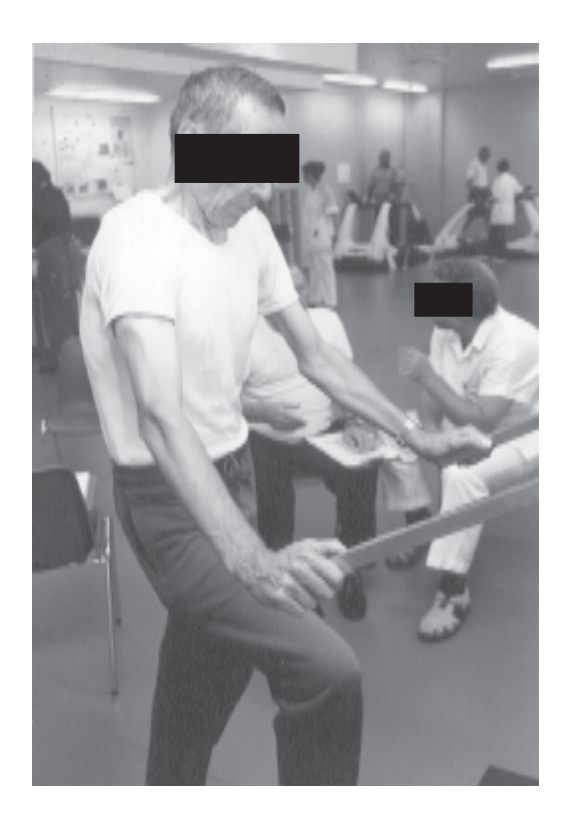
Figure 4. Forward leaning position allowing accessory muscle recruitment and dyspnea relief.

severity of airway obstruction, changes in minute ventilation or improved oxygenation<sup>26</sup>. Hyperinflation and paradoxical abdominal movement have indeed been related to dyspnea relief in the forward leaning position<sup>26</sup>. Alternatively, forward leaning has been associated with significantly reduced electromyographic (EMG) activity in the scalene and sternomastoid muscles, increased transdiaphragmatic pressure and significantly improved thoracoabdominal movements<sup>26</sup>. From these studies, it was concluded that the subjective improvement in dyspnea among patients with COPD was the result of the more favorable position of the diaphragm on its length-tension curve. In addition, forward leaning with arm support allows accessory muscles (pectoralis minor and major) to contribute significantly towards rib cage elevation. Banzett showed in healthy subjects that this position enhanced ventilatory capacity<sup>27</sup>. The same holds for the forward leaning position with head support, which allows the accessory neck muscles to assist inspiration.