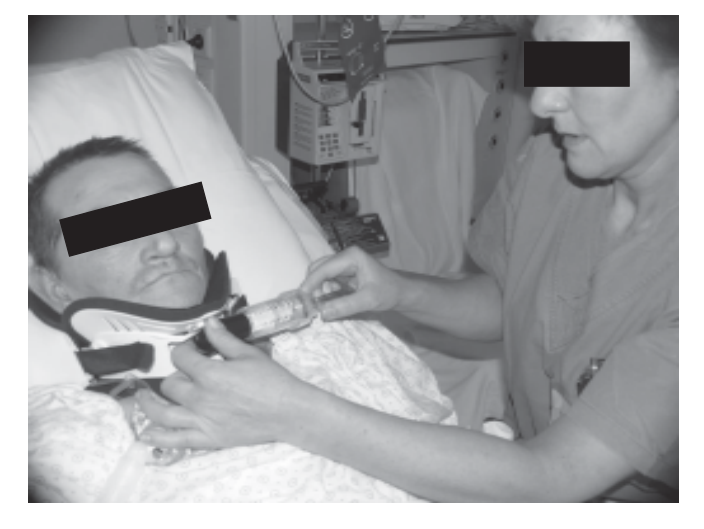
Figure 6. Respiratory muscle resistive training with threshold loading in a patient being weaned off mechanical ventilation.

than does exercise training alone<sup>36,37</sup>. The additional effect of IMT on exercise performance seems to be related to the presence of inspiratory muscle weakness<sup>32</sup>. At present there are no data to support resistive or threshold loading as the training method of choice. Threshold loading enhances the velocity of inspiratory muscle shortening<sup>38</sup>. This might be an important additional effect, as this shortens inspiratory time and increases the exhalation and relaxation time.