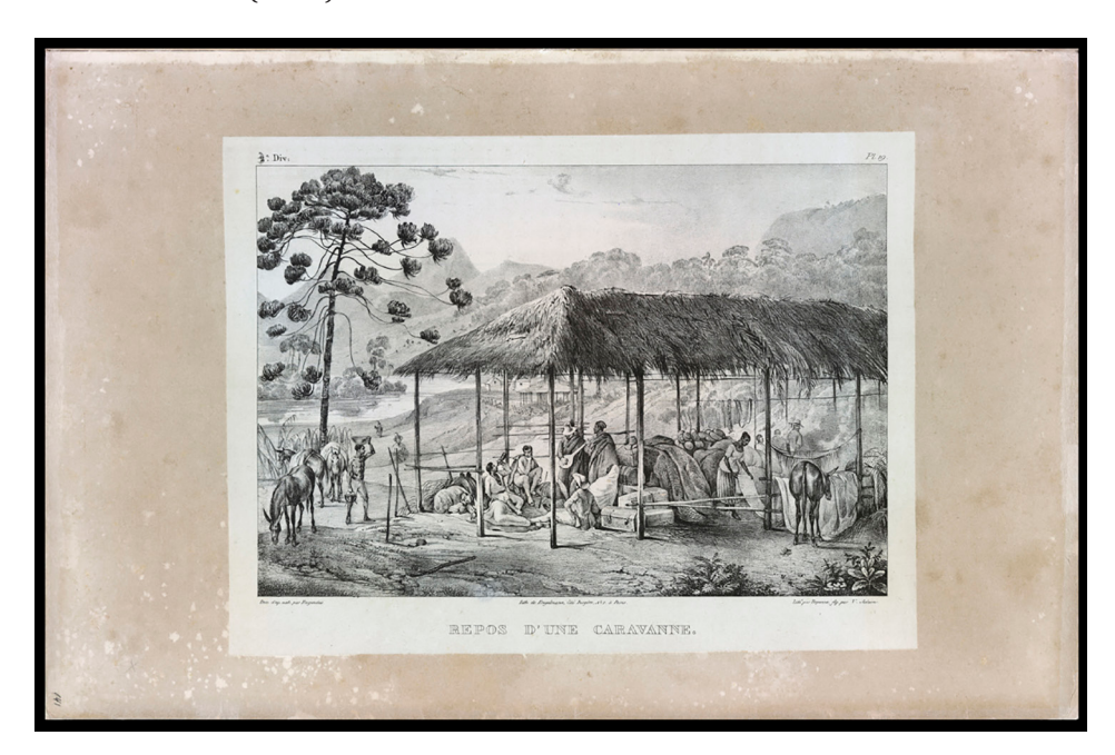
Figure 1 Johann Moritz Rugendas. Repos d'une caravane.

image of the pouso to the open ranch, covered by sapé , where the tropeiros rested while listening to guitars, as Johann Moritz Rugendas it on the Repos d'une caravane (1835).