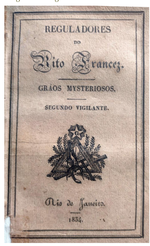
Figure 6 – Reguladores do Rito Francez

New and for sale at Seignot-Plancher e Comp., THE REGULATORS OF THE SYMBOLIC AND MYSTERIOUS DEGREES OF THE FRENCH RITE, With the detailed explanation of all the obligations of the Grand Officials in the Lodge, accompanied by instructions and catechisms appropriate to each of the seven Degrees of the Modern Rite, etc., etc. 8 Pamphlets, in the brochure - 8,000 Rs. This work is the translation of the Regulators published a few months ago in France, the most complete and perfect of those which until now have served as the base for the work of the lodges from the French Rite. Nothing has been published in Rio de Janeiro about this material which could meet the expectations of the most instructed initiates in the Order of Masonry: the REGULATORS now offered to the Public are recommended both for the importance of the subject and the clarity of the explanations, the purity of languages, and the sharpness of the printing.<sup>13</sup>