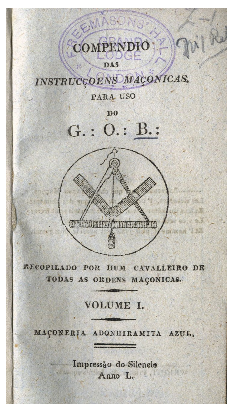
Figure 1 – Compendio das Instrucçoens Maçonicas para uso do G.: O.: B.:

12 x 7.5 cm. Call Number: VBR 200 BRA; ID: L4297.