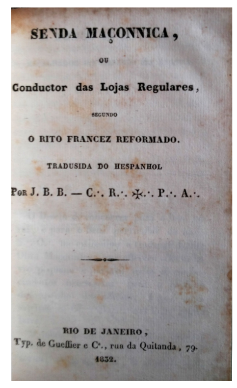
Figure 3 – Senda Maçonnica

French booksellers effectively propelled in the capital the production of Masonic production from 1832 onwards, notably guides and rituals. An example of this is a book entitled MASONIC PATH, // OR THE CONDUCTOR OF THE REGULAR LODGES, // ACCORDING