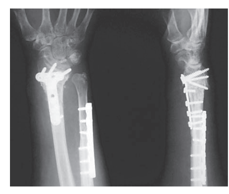
Figure 5 - Radiographs on PA and lateral planes, showing bone union after 24 weeks of surgical treatment of pseudoarthrosis of distal radius fracture in patient number 2.