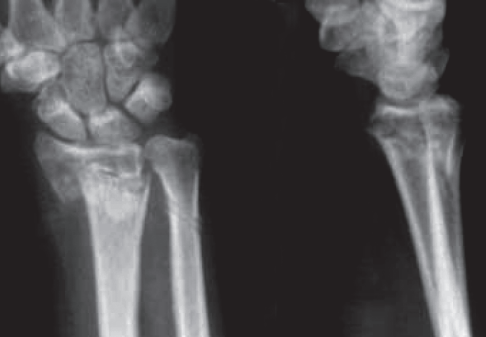
Figure 1 – Radiographs on PA and lateral planes of a pseudoarthrosis of distal radius fracture in patient number 1.