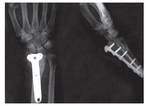
Figure 6 - Radiographs on PA and lateral planes, showing bone union after 14 weeks of surgical treatment of pseudoarthrosis of distal radius fracture in patient number 4.