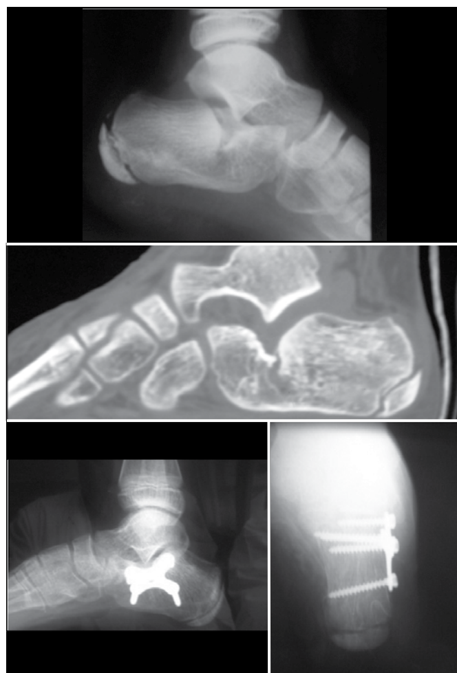
Figure 3. Comparison between preoperative aspect and one year after surgery.

Nonsurgical treatment methods for calcaneal fractures usually result in many deformities, such as widened heel, uneven subtalar articular surfaces, collapse of the arch of the foot, hindfoot