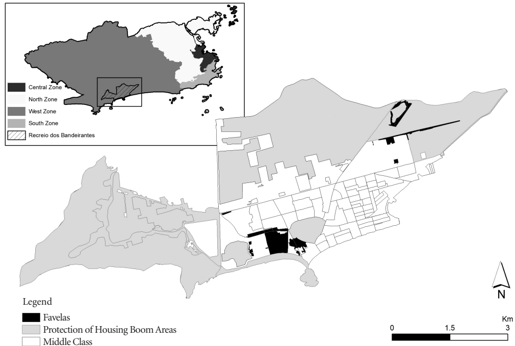
Figure 1. Structure of the urban occupation of Recreio dos Bandeirantes, Rio de Janeiro (RJ), Brazil.

While approximately 60% of residents in the neighborhood claim that their households