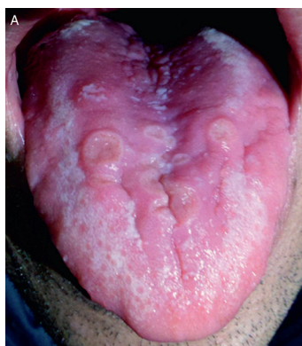
Fig. 1 – Asymptomatic ulcerated lesions in the tongue.

A 35-year-old man presented with a 3-week history of asymptomatic ulcerated lesions in the tongue (Fig. 1). He developed erythematous papules in the trunk and legs at the same time. The patient had no other systemic symptoms and reported having had unprotected sexual intercourse. Testing for the human immunodeficiency virus was positive. VDRL testing was positive with a titer of at least 1:64. A tongue biopsy revealed an inflammatory infiltrate suggestive of secondary syphilis with positive immunohistochemistry for Treponema pallidum (Fig. 2). The patient was treated with intramuscular benzathine penicillin for two weeks. The lesions completely resolved during a 4-week period. Syphilis is well known for