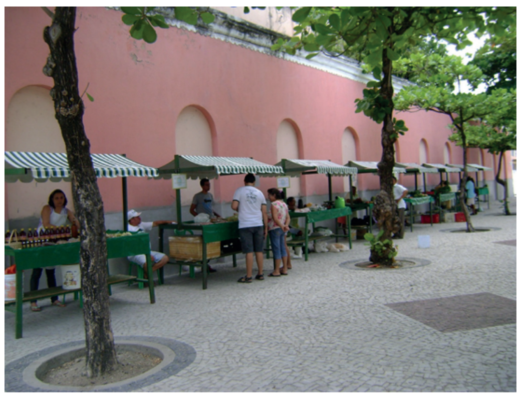
Figure 2: Mossoró Agroecological Fair

Figure 2 shows the sales environment, portraying solidarity at work, as mentioned above. Stalls are close together and frequently shared between two smallholders, fostering friendship ties. Solidarity is also portrayed in the productive process. Farmers claim that they donate/exchange productive inputs whenever necessary.