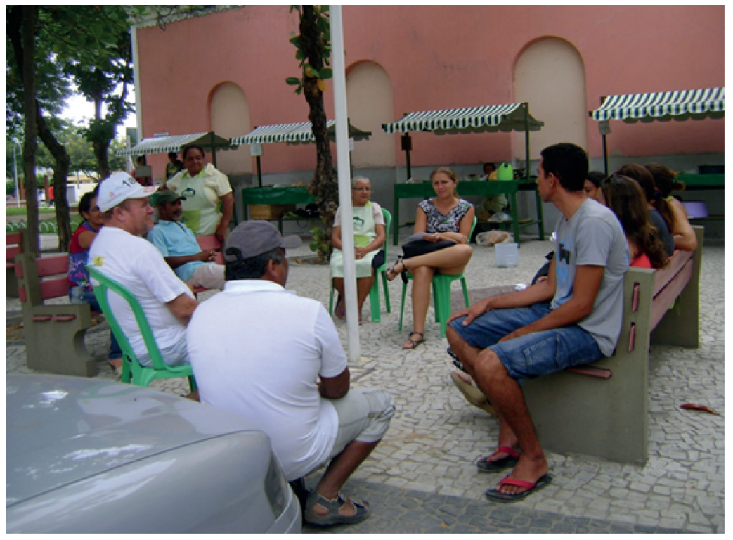
Figure 3: After-hours traders' meeting at the fair