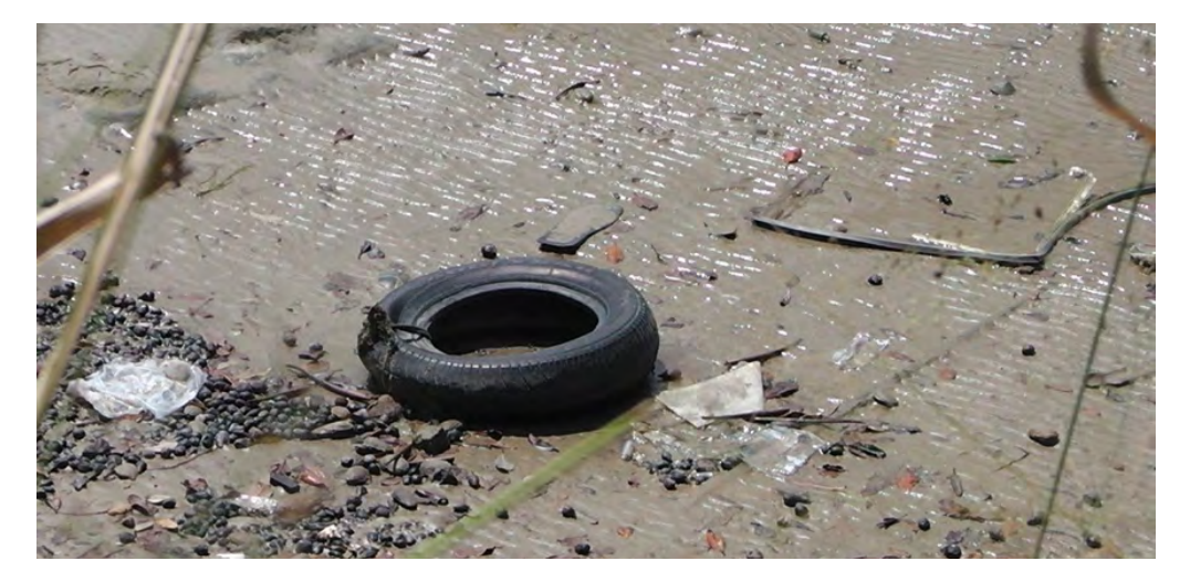
Picture 4: Waste from the automotive production chain poses risks to the of the District of Mutá Mangrove areas, Jaguaripe – BTS

Other problems in mangroves are caused by the automotive production chain, which consists of two segments: car manufacturers and auto parts. Tires are produced by companies that are part of the auto parts segment, and the disposal of this material is regulated by CONAMA Resolution No. 416 of September 30, 2009, which features the liability of importing companies and national manufacturers regarding worn-out tires and their aggressive effects on the environment (BRASIL, 2009). Visual pollution and degradation of marine flora and fauna, breeding grounds for disease-transmitting insects, negative impact on the soil, and obstruction of tidal waves, which bring crucial nutrients to the ecosystem balance, are some of the damages caused by improper disposal of tires in the mangrove (Picture 4).