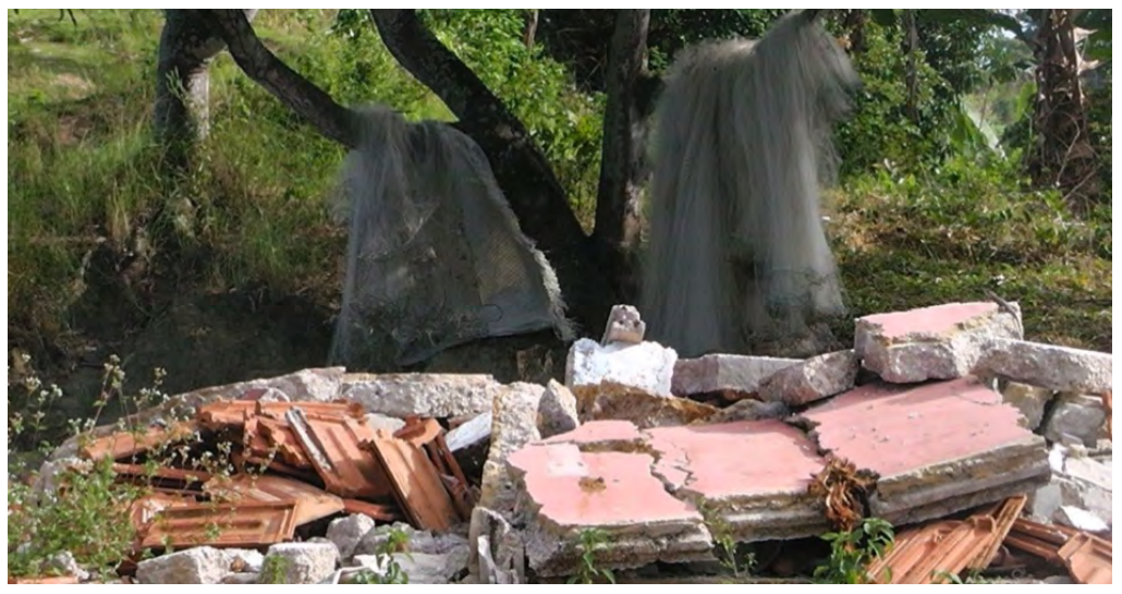
Picture 5: Waste from the civil construction sector impacts the Mangrove area of BTS

As customary as they are impactful, waste from the construction sector causes irreversible damage to the mangrove environment, especially in terms of soil quality, since large volumes of rubbish are dumped into nature without any treatment. The consequences of the inadequate action of waste disposal on the coast of Bahia are countless and perhaps immeasurable. According to Marques Neto (2005), the productive sector of civil construction is responsible for 50 to 70% of urban solid waste generation and uses 75% of the natural resources from the planet, causing a huge environmental impact, mainly in urban centers, where 85% of the Brazilian population. The coastal area of BTS faces the same problem as hundreds of cubic meters of civil construction debris impact the mangrove (Picture 5).