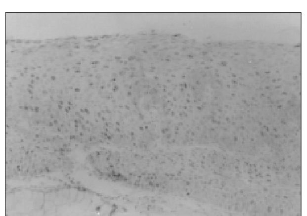
Figure 1. In this figure many Ki-67 positive cells can be seen in all layers of the epithelium in a case of HAIN from an anal verge biopsy. (X225).

The ages in Group 1 varied from 21 to 50 (mean 29.8 years), and in Group 2 the mean age was 34.8, ranging from 22 to 45 years.