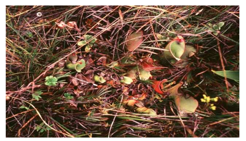
Figure 1 - Heliamphora nutans within a dense vegetation of non carnivorous plants.

Concerning air temperature and solar radiation, no significant differences between the conditions within the Heliamphora population and 2 m above was found. Air humidity, however, was more than two times higher next to the Heliamphora plants. The humidity decreased abruptly about 1.7 m above the ground. Interestingly, this was also the maximum height of Bonnetia trees at the test site. The wind speed could not be measured continuously, but was always very low and almost zero within the Heliamphora population.