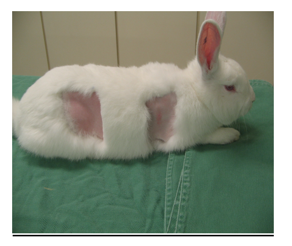
Figure 1. Preparation of the rabbit, with depilation of a 36 \text{cm}^2 area in the right dorsolateral cranial region for subsequent inoculation using M. canis , and the right caudal region which was not scarified or inoculated.