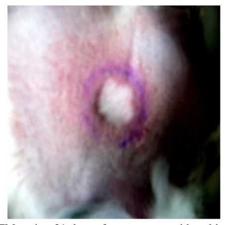
Figure 4. TM region 21 days after treatment with terbinafine cream, evidencing local hair regrowth and absence of erythema or desquamation.