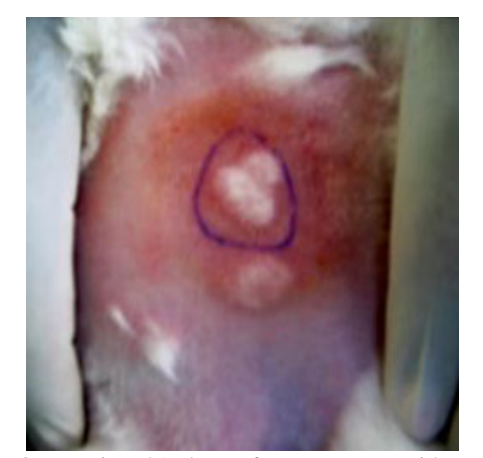
Figure 5. OM region 21 days after treatment with ozonized oil showing hair regrowth, absence of erythema or desquamation, and slight yellowish coloration due to accumulation of oil following a series of daily applications of the product.