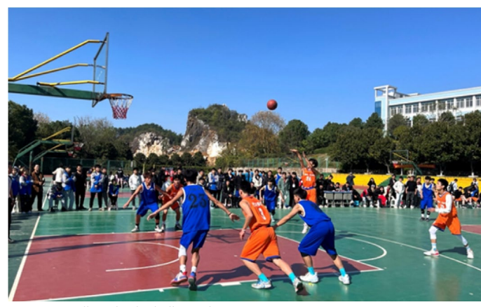
Figure 1. College basketball match.

Basketball is famous for its rapid movement and fierce competition. With the continuous improvement of the basketball level, the competition is also increasing, resulting in more and more injuries. In all aspects of injuries of basketball players, ankle joint injuries account for a large proportion, which has a great impact on the sports career of basketball players. This requires that athletes can analyze the causes of ankle joint injuries in an all-round way, so as to carry out comprehensive prevention in future basketball games and avoid major damage to themselves. The ankle joint is one of the joints that are easy to be injured in our basketball sports. In normal training, the practitioner should strengthen the practice of all aspects of the body