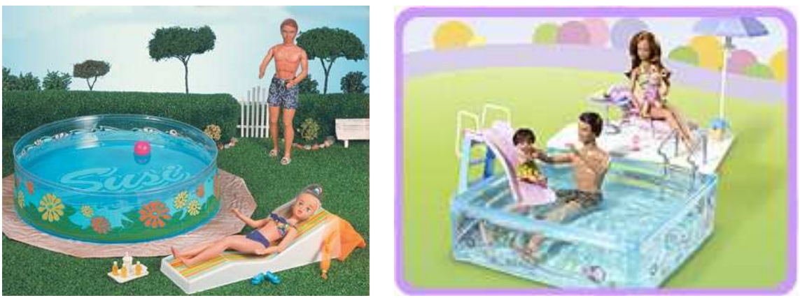
Figure 1 – Images of Susi and Barbie with their counterparts Beto and Ken, respectively, placed in adult contexts.

Be that as it may, some of Susi and Barbie 's visual representations do bear strong similarities: they entail adult activities such as being placed in domestic contexts which evoke marital life (Figure 1), household duties like being located in a 'super kitchen' or in a living room, going to the florist's or to the hairdresser's.