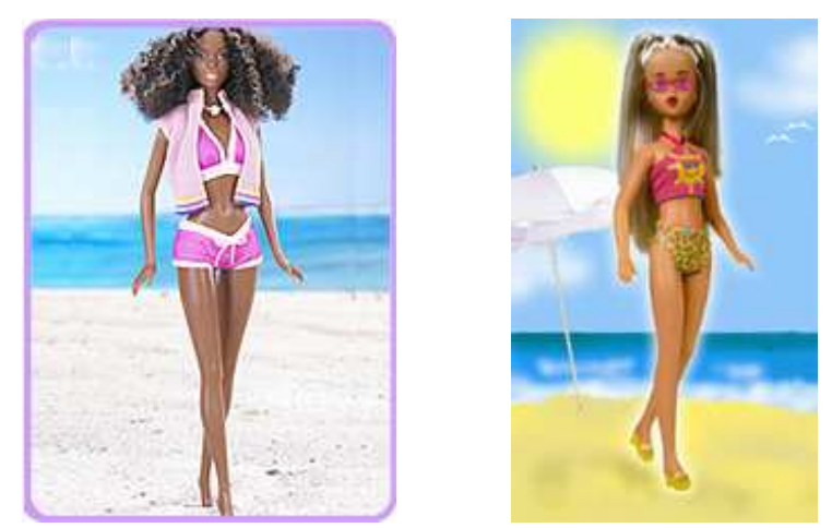
Figure 2 – Paradoxical relations between the images of Barbie and Susi in their summer outfit versions: 'Brazilianness' in Barbie and 'Americanness' in Susi? (retrieved from www.barbie.com and www.estrela.com.br).

In fact, Downie (2000) admits that, at first glance, Susi and Barbie are not that different as "both have impossibly long hair and clear blue eyes". Yet he also agrees with Estrela 's marketing director Aries (quoted in DOWNIE, 2000) that Susi 's prototype has been moulded to look more Latin and therefore, more 'voluptuous'. Indeed, Aries (quoted in DOWNIE, 2000) fiercely defends that " Susi resonates with Brazilian girls" for a number of reasons: