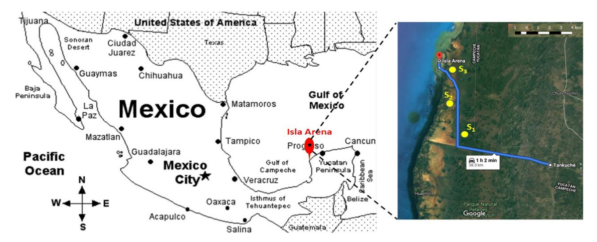
Figure 1. Sampling points (from 1 to 3) collected in the RBLP for metagenomics analysis.

The salinity of the collected samples was obtained by the determination of chlorides using the Mohr method (Sheen and Kahler, 1938). The sample consisted of a 1:10 dilution of water and sediment, respectively, a 0.1 M silver nitrate (AgNO<sub>3</sub>) solution was added, and 5% potassium