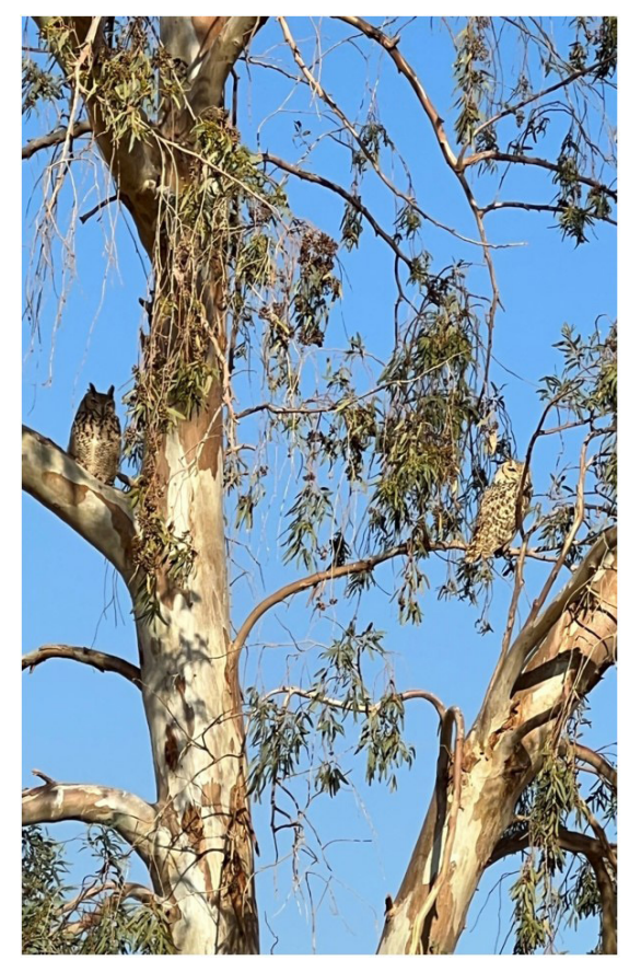
Figure 1. Two individuals of B. ascalaphus perching on a Eucalyptus tree in Bsitah site.

The length and width of the collected 39 (19 from Bsitah and 20 from Al Daba'ah) intact pellets were measured by a digital caliper. Each pellet was soaked in warm water and teased using a pair of forceps and a needle to separate prey remains for identification. Recovered items from each pellet were placed in a Petri dish. For each species, the lower and upper jaws were cleaned and preserved. Prey remains were identified using distinctive morphological characteristics of body and/or skull parts (e.g. mandibles and maxillae) described based on previous collections from the region (Amr, 2012) as well as Iyad Nader small mammals collection kept at the NCW. Arthropod remains were identified up to the family level.