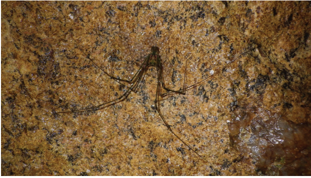
Figure 3. A female Heteromitobates discolor (body size ~7 mm) guarding eggs.

boulders. The latter are probably more humid because they are by the river and also probably less visited by predators than the vegetation. Although larger trechaleid spiders are also found on such boulders, harvestmen might be chemically and mechanically protected from their attacks (Machado et al. 2005; Souza & Willemart 2011; Dias & Willemart 2013; Segovia et al. 2015a, b). It is still not clear why some harvestmen forage on the vegetation and others on the floor. Although there seem to be a relation between leg length and resting area (leaf litter vs vegetation), with long-legged species being found on the vegetation and short-legged ones on the floor, leg length per se may not be an explanation for the foraging sites since several long-legged species in the suborder Eupnoi forage on the floor (Curtis & Machado 2007; Donaldson & Grether 2007).