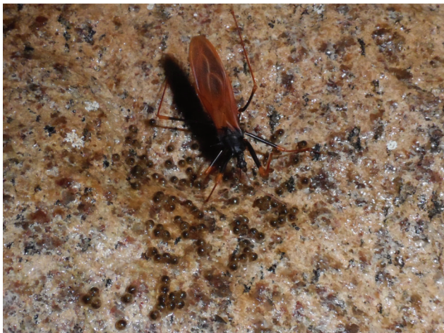
Figure 4. A heteropteran, Zelurus sp. (probably travassosi ), on an egg batch of Heteromitobates discolor . Egg diameter ~1.9 mm.

Egg batches were laid mainly in non-exposed and dark areas, contrasting with Heteromitobates albiscriptus