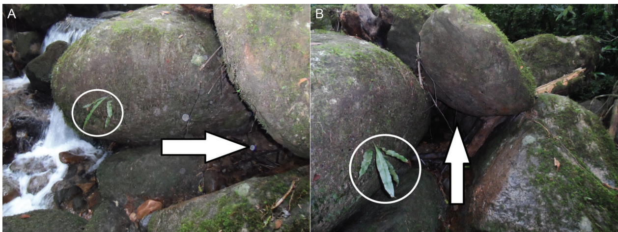
Figure 2 A and B. A typical shelter where the harvestman Heteromitobates discolor is found during the day. The same area is shown from different angles, with arrows showing the approximate region of an oviposition site. The circle indicates the same landmark in the two pictures.

No individual was seen foraging on leaf litter, unlike several harvestmen (Curtis & Machado 2007) but similar to other species in the subfamily Goniosomatinae (Machado et al. 2000; Willemart & Gnaspini 2004b; Caetano & Machado 2013), which may climb higher than 20 m to forage (Santos & Gnaspini 2002). The foraging site – vegetation, is clearly different from the resting and ovipositing sites - granitic