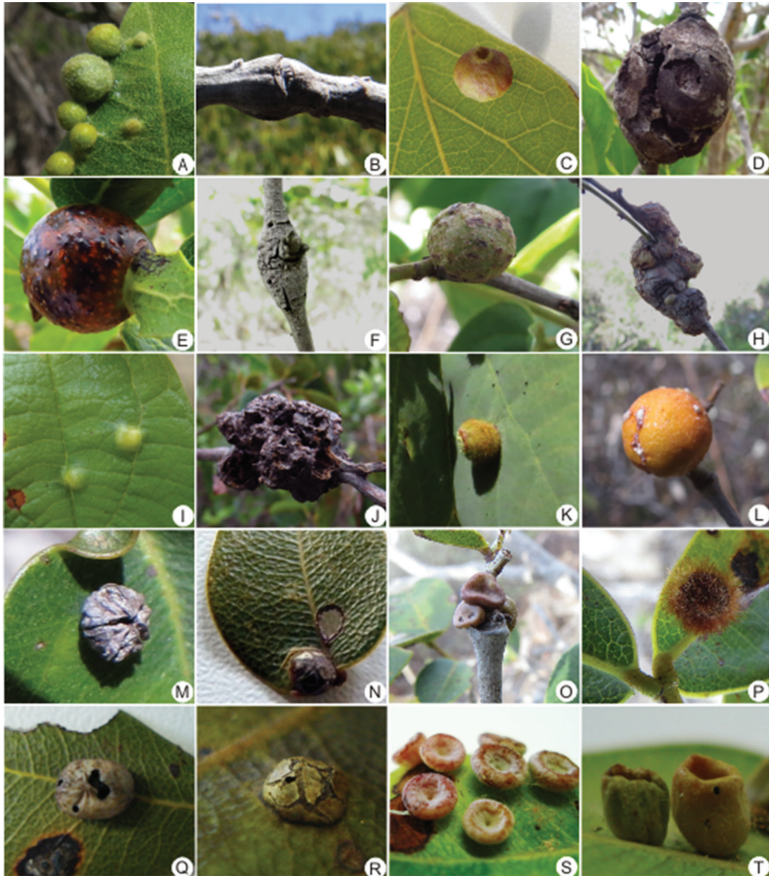
Figure 1. Insect galls from Serra Geral, Caetit , Bahia, Brazil. A. Duguetia furfuracea (A.St. Hil.) Saff. B. Eremanthus capitatus (Spreng.) MacLeish. C. Combretum leprosum Mart. D-E. Emmotum sp. F-J. Bauhinia acuruana Moric. K. Bauhinia pulchella Benth. L-T. Copaifera langsdorffii Desf.