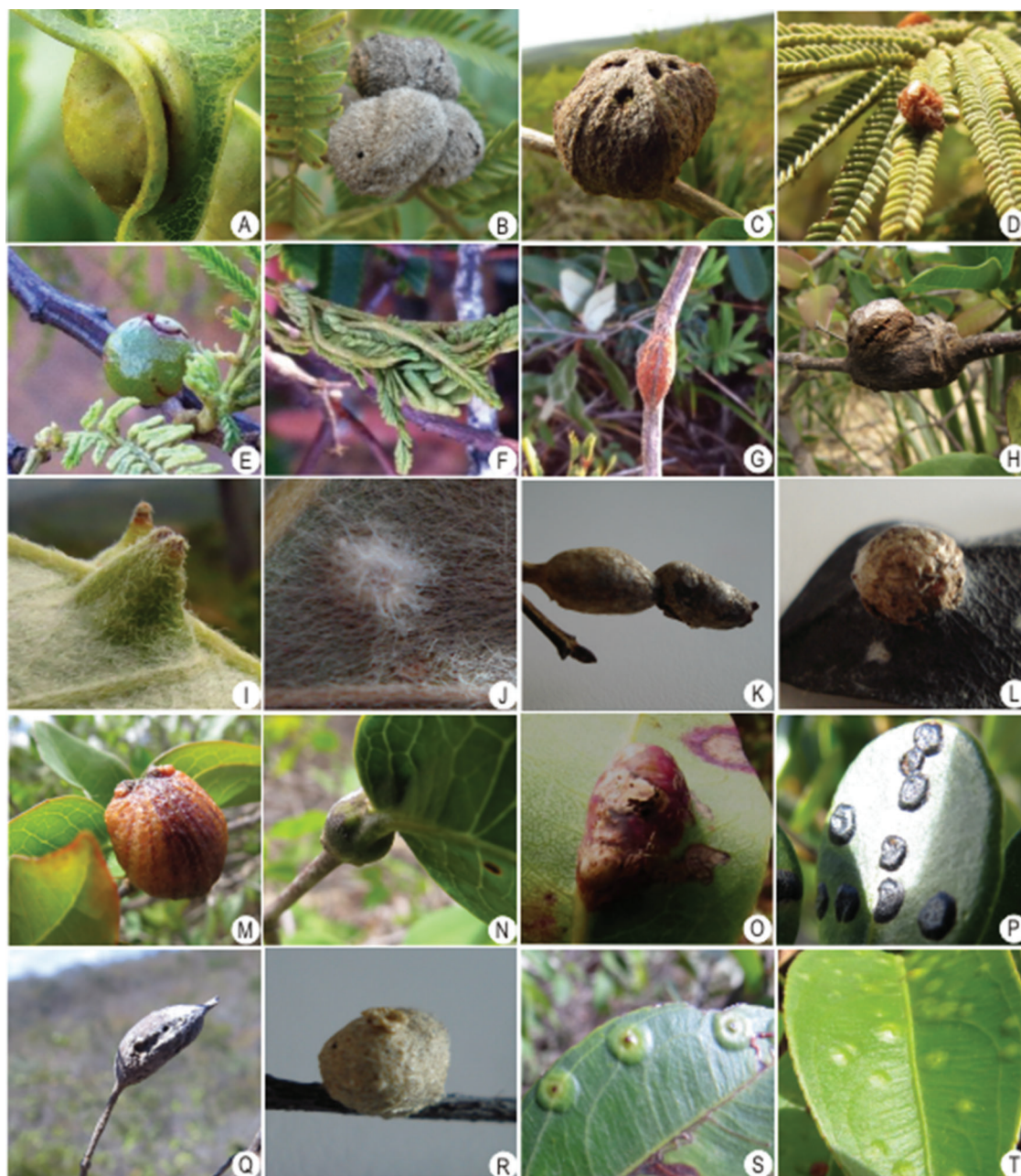
Figure 2. Insect galls from Serra Geral, Caetit , Bahia, Brazil. A. Copaifera langsdorffii Desf. B. Calliandra dysantha Benth. C. Calliandra sessilis Benth. D-G. Mimosa gemmulata Barneby. H. Banisteriopsis sp. I. Byrsonima starnnardi W.R.Anderson. J. Thryallis sp. K-O. Malpighiaceae Indet. sp. 1-4. P-Q. Eugenia puniceifolia (Kunth) DC. R. Nyctaginaceae Indet. S-T. Ouatea sp.