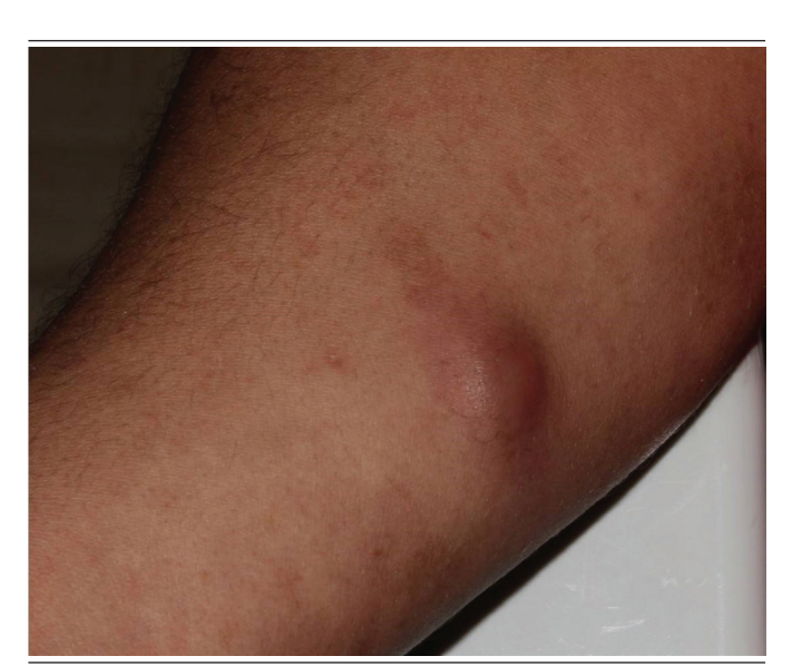
FIGURE 1 - Painless nodular lesion, about 4 cm long on the patient's left arm

Once the diagnosis of HIV and KS with oral and skin lesions was established, the patient began highly active antiretroviral therapy (HAART), as well as additional chemotherapy. After an 11 months' follow-up, the skin lesion regressed completely, with only a brownish hyperpigmentation of the skin ( Figure 4 ) remaining. At the same time, oral lesions regressed almost completely, also with red hyperpigmentation areas ( Figure 5 ) being observed. There was improvement of the patient's general health condition.