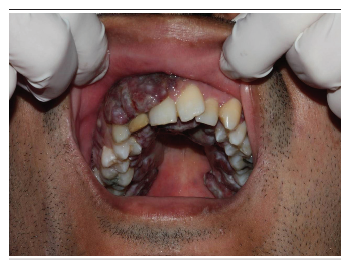
FIGURE 2 – Initial clinical aspect of the patient's intraoral lesions before the use of antiretroviral therapy: multinodular, erythroleukoplastic lesions of fibroelastic consistency and bleeding in the palate, in the upper anterior labial ridge, and the right and left inferior retromolar regions