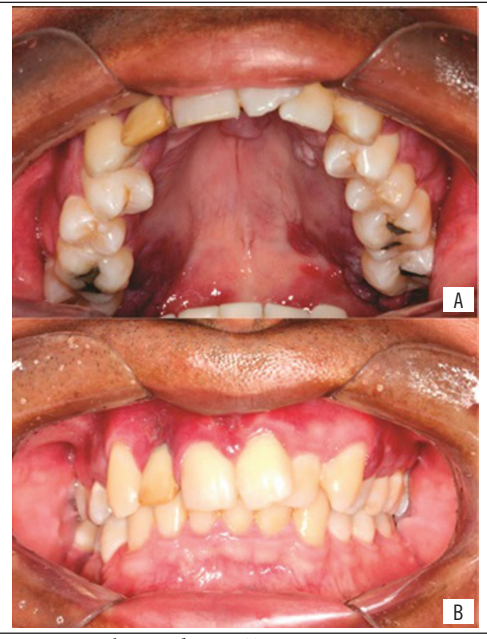
FIGURE 5 — Patient's oral aspect after HAART

A) significant regression of intraoral lesions is observed after 11 months of treatment with antiretroviral drugs; B) patient's oral aspect after HAART.