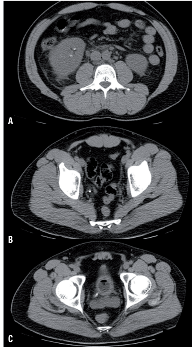
Figure 1 - CT at the admission. Residual stone fragments in the lower calyx (a), and in the lower tract of the ureter (b and c).