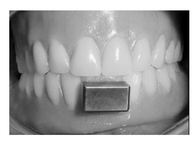
FIGURE 2- Magnet tracking device attached to the midline labial surface of the mandibular denture