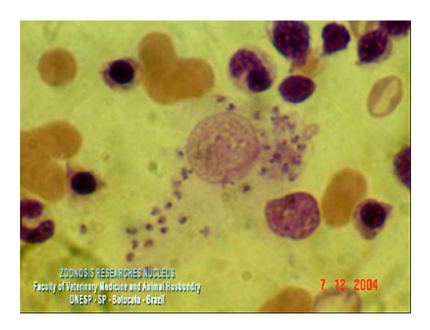
Figure 4: Amastigote forms of Leishmania sp from bone marrow aspirate, stained by the Giemsa method (X1000).