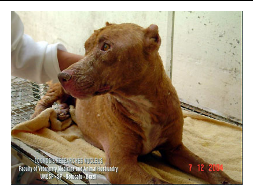
Figure 1: Clinical presentation of the dog, with generalized skin lesions in the body and partial damage of the external ears.