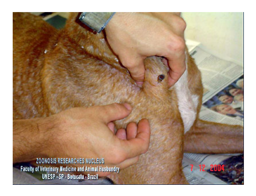
Figure 2: Puncture of the right pre-scapular lymph node