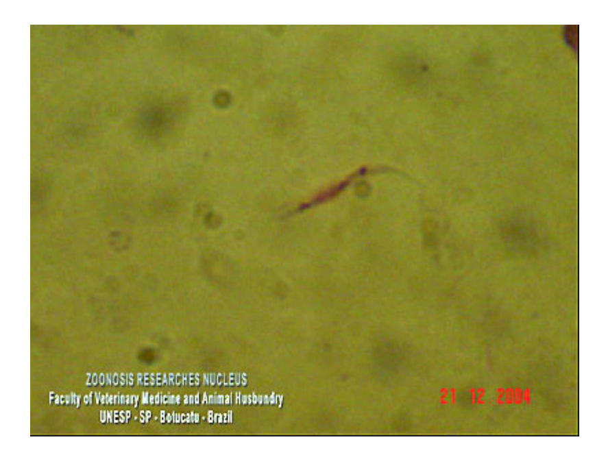
Figure 5: Smear of promastigote forms in LIT culture, isolated from the bone marrow puncture after 13 days of incubation at 28-30°C, stained by the Giemsa method (x1000).