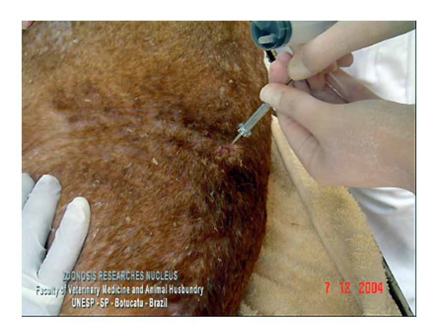
Figure 3: Puncture of the bone marrow