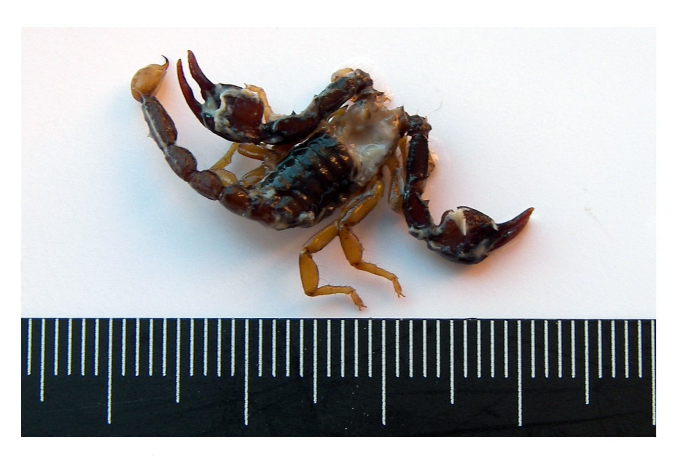
Figure 1. Euscorpius flavicaudis that stung the subject of the present report.

The patient was stung on the palm of the left hand and complained of intense burning pain at the sting site where the aculeus had penetrated the skin, resulting in a 3-4 mm red area. The subject had no other systemic symptoms. A full blood count, liver function and coagulation tests, electrolyte blood levels and other routine laboratory tests were all normal, as were the results of urinalysis. An electrocardiogram recorded an hour after the sting revealed nothing unusual. In the meantime pain and inflammation diminished. A gynecological exam showed normal abdominal findings and no uterine contractions. Given the low toxicity of the species involved, the woman was discharged an hour and a half after the sting and advised to seek her family physician in the event of any new symptoms associated with the sting.