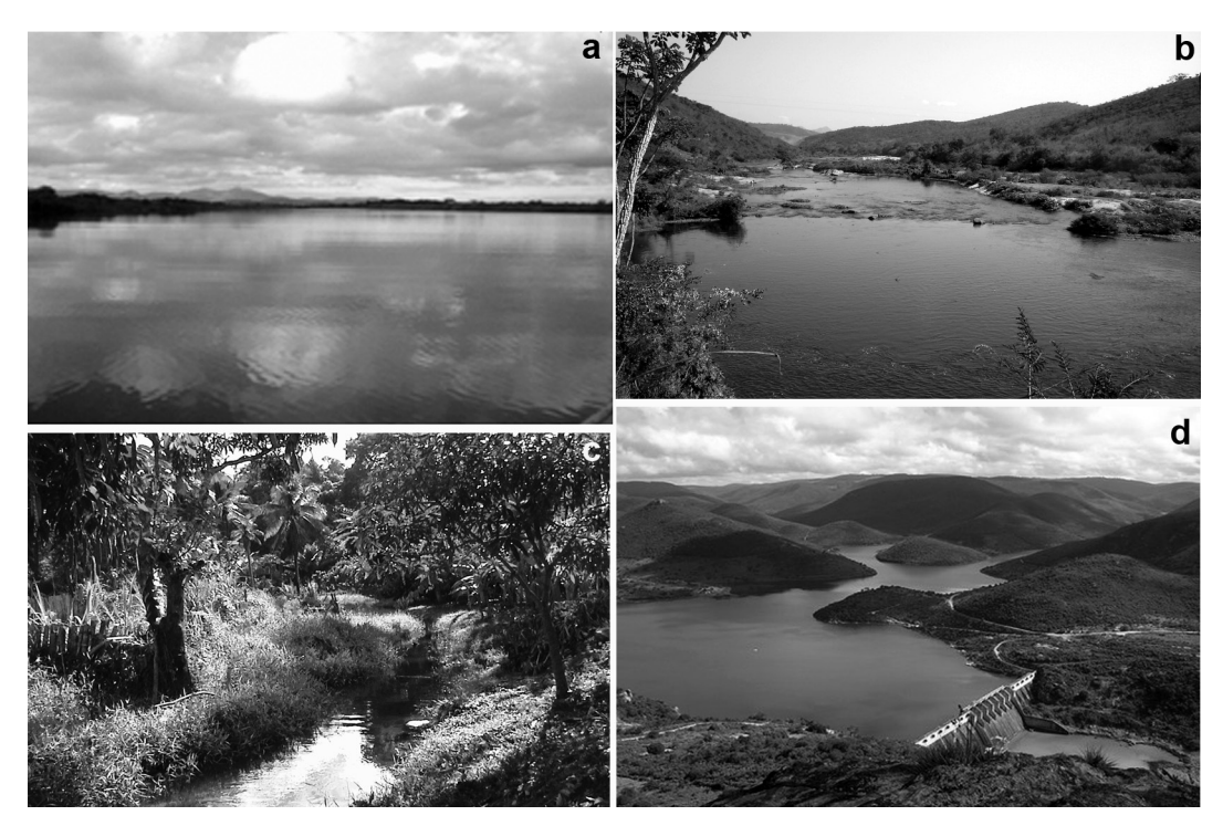
Fig. 2. Partial view of collection sites of Astyanax aff. bimaculatus in the State of Bahia, Brazil: (a) Contas River, upstream Pedra Dam, Porto Alegre County – site A, (b) Contas River, downstream Pedra Dam, city of Jequié – site B, and (c) Mineiro stream, Recôncavo Sul Basin, city of Itamari – site C. In (d), view of Pedra Dam reservoir in Middle Contas River, city of Jequié.