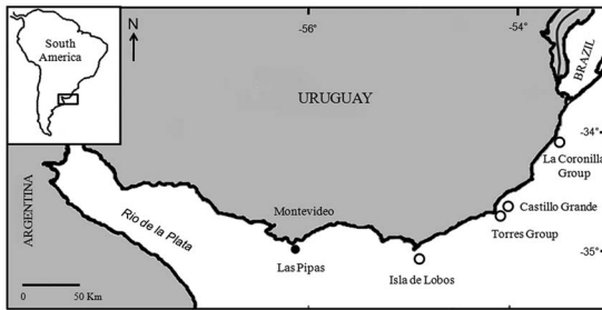
Figure 1. Map of the coast of Uruguay showing all the Pinniped groups of Islands

limit of breeding sites of Southern sea lions in the Atlantic Ocean (VAZ-FERREIRA, 1956). This colony has scarcely ever been counted in the past. In 1953 the birth of 516 pups of O. flavescens was reported, and in 1975 the number of newborn pups had decreased to 100 (VAZ-FERREIRA, 1982). In January 1977 on Isla Verde, only 24 adults and 4 pups were recorded and an “imminent extermination” was mentioned (PILLERI and GIHR, 1977). However in that study, Coronilla islet was not sampled. The last published report on the abundance at the La Coronilla Group was in 1995, when 244 adults and subadults were recorded in Winter and 31 pups in Summer (PONCE DE LEÓN, 2000). Since then no data of abundance of pinnipeds has been recorded, as these islands are not included in the annual population abundance estimations carried out by DINARA. In December 2008, January and April 2009 three counts were made from a boat around Isla Verde and Islote La Coronilla (LEZAMA and SZTEREN, 2009) where 93, 136 and 82 animals were counted respectively; 20 pups were observed in January and 11 in April. Nevertheless, the contribution of this area to the total sea lion population is still uncertain.