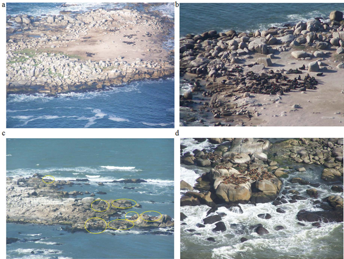
Figure 4. Localization of some sea lion groups a) dispersed on the beach, in June 2008; b) on the beach, more concentrated and near the sea in September 2008. c) on the rocks, in November 2008.

age categories is similar to the structure typical of other breeding areas (CRESPO and PEDRAZA, 1991; DANS et al., 1996; ACEVEDO et al., 2003; SEPÚLVEDA et al., 2011). I propose it could correspond to a colony with low breeding activity. It is important to note that this structure differs from that found in 1995 (PONCE DE LEÓN, 2000), where in Winter it was a haul-out site for sub-adults and adult males and in Summer there were females and pups, which would migrate afterwards to other Winter haul-outs.