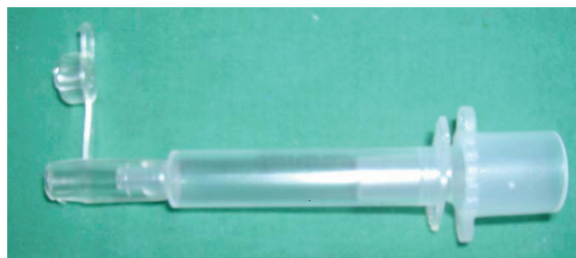
Figure 1 - Adaptor for trans-tracheal ventilation.

Supraglottic pathology can make proper positioning of an LMA difficult or impossible. 1 In addition, post-radiotherapy patients often have distorted airway anatomies, which may cause difficulty in endotracheal intubation and problems when ventilating through supraglottic devices. LMA insertion and