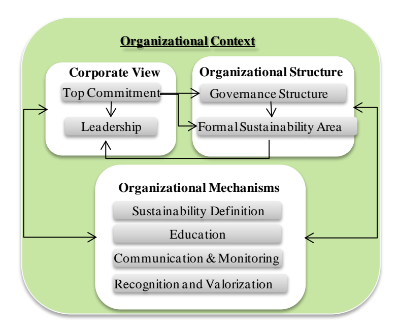
Figure 1. Conceptual Model for the Integration of Sustainability into Business Practices.

The model presented in Figure 1 represents the main outcome of this research. Grounding from systematic execution of the 9 steps of the adapted grounded approach, this model is original, growing out of the Brazilian context, and facilitates integration of sustainability and social responsibility into business practices. The model identifies a group of institutional factors that serve as drivers or facilitators of such integration. The model consists of three broad categories: corporate view, organizational structure and organizational mechanisms. Within each category we identified subcategories or properties between which relationships were established.