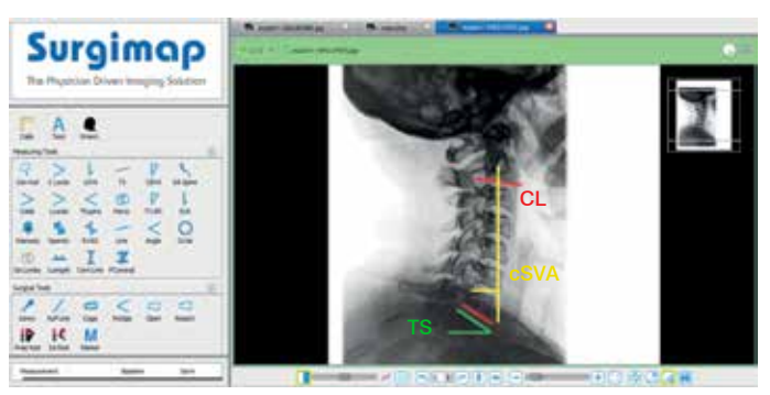
Figure 1. Example of a digitalized image with measurements of the radiographic parameters of interest (cSVA, TS, and CL) using Surgimap Spine software (Nemaris Inc., New York, USA).

Lateral total spine radiographs of the patients were taken in a standing position with their eyes fixed on the horizon. Only exams that permitted adequate visualization from the base of the skull to the first thoracic vertebra (T1) were considered. The digitalized images obtained were analyzed using Surgimap Spine software (Nemaris Inc., New York, USA) to measure the following radiographic parameters of cervical sagittal alignment: cervical lordosis (CL), cervical sagittal vertical alignment (cSVA), the angle of inclination of T1 (TS), and the difference between the T1 inclination and the cervical lordosis (TS-CL), as illustrated in Figure 1.