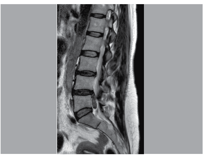
Figure 2. Example of T2-weighted magnetic resonance sagittal cut with migrated lumbar herniation, Zone 4.

spine surgery or who had any other disease of the segment being analyzed were excluded.