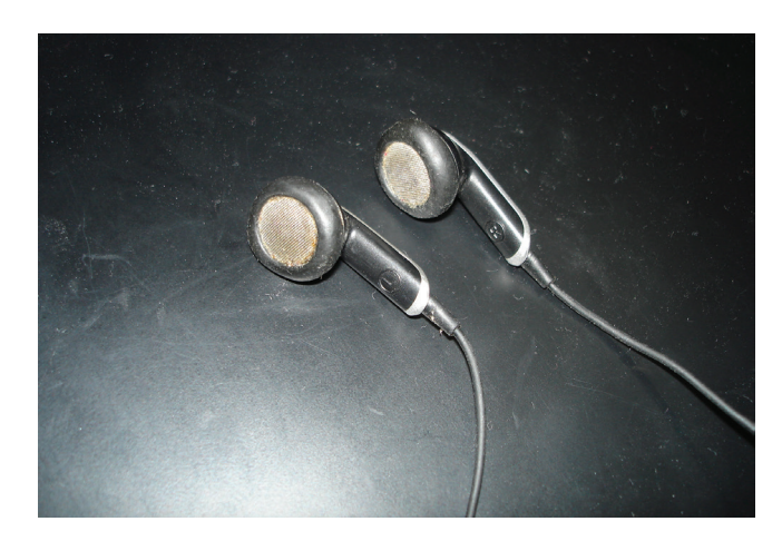
Figure 1 Insertion earphones.

The study involved the collaboration of volunteers. First, the subjects were informed about the study and signed an informed consent. The project was presented to the research ethics committee of the institution, and approved under number 229/2008. Additionally, the project is in accordance with resolution 196/96 of the Brazilian National Health Council.