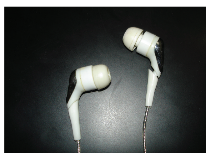
Figure 2 Anatomical insertion earphones.